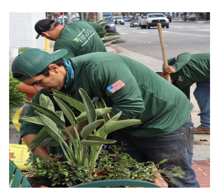
The professionals at The Standard Design Group Nurseries planting new Birds of Paradise, Red Carpet Roses and Red Geraniums in our freshly painted pots.